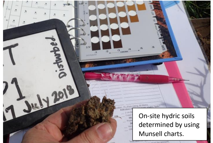
On-site hydric soils determined by using Munsell charts.