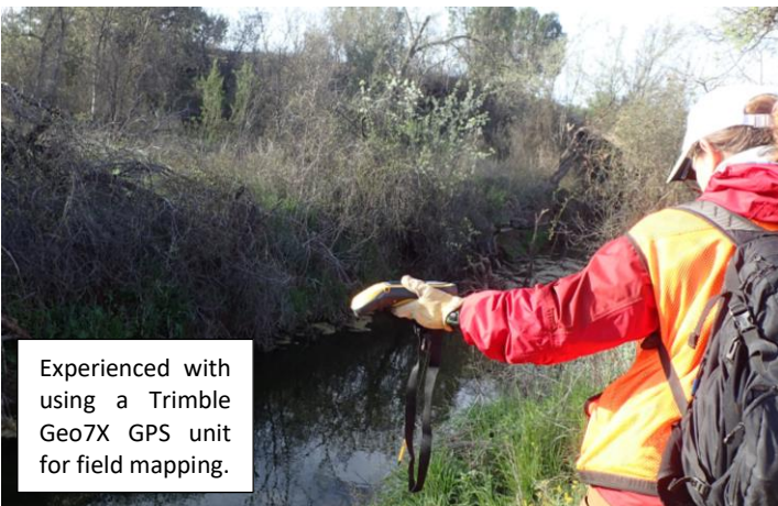
Experienced with using a Trimble Geo7X GPS unit for field mapping.