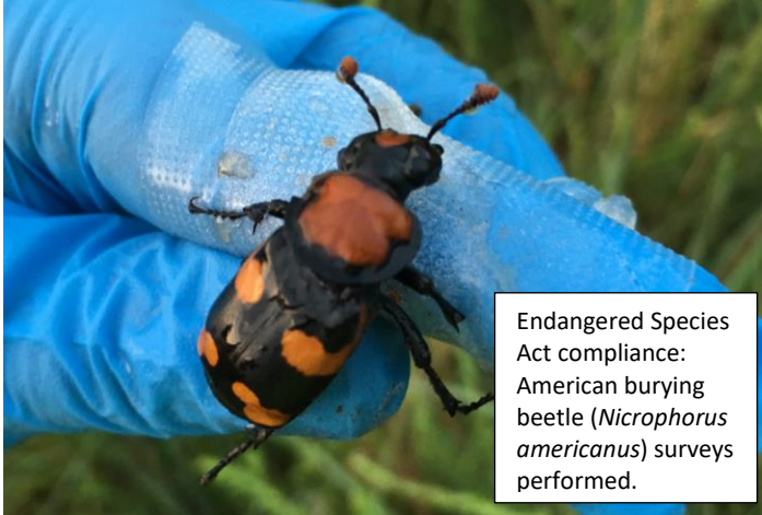
Endangered Species Act compliance: American burying beetle ( Nicrophorus americanus ) surveys performed.