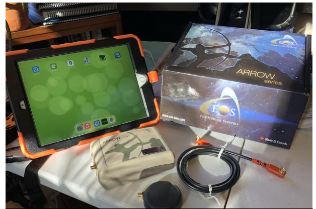
Recently acquired submeter GNSS receiver for submeter mapping using IOS devices and ESRI Field Maps app.

Office Location: 278 Greenhouse Road, Bentonville, AR 72713 Mobile 479.659.4380