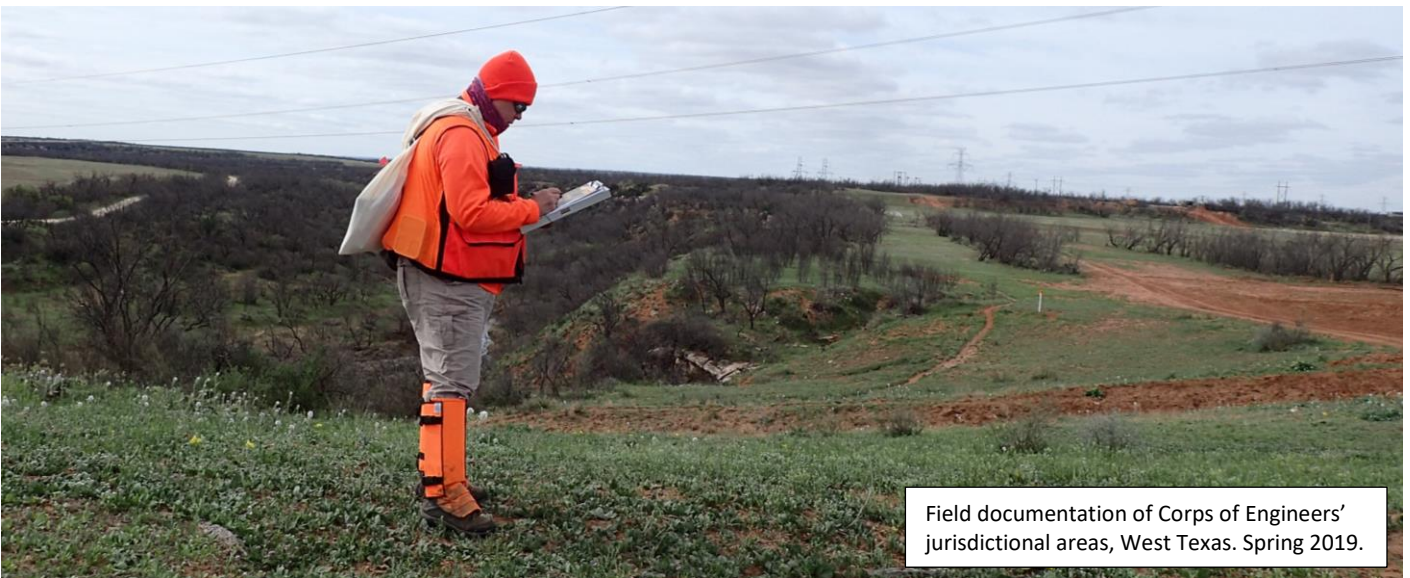
Field documentation of Corps of Engineers' jurisdictional areas, West Texas. Spring 2019.